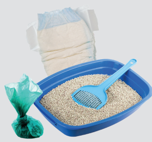
Pet Waste & Diapers