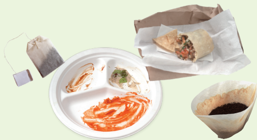
Food & Beverage Soiled Paper