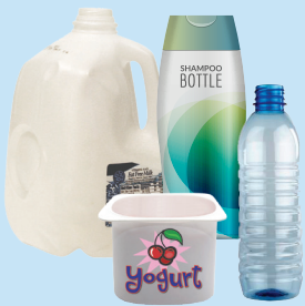
Plastic Containers #1-7