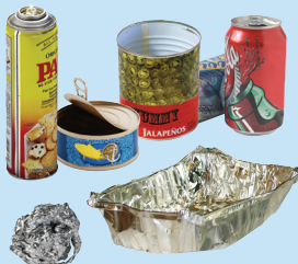
Metal & Aluminum