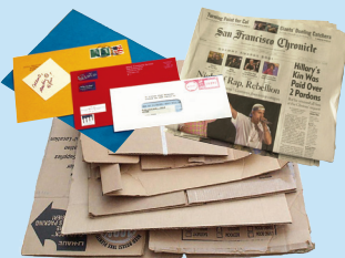
Clean Paper Products