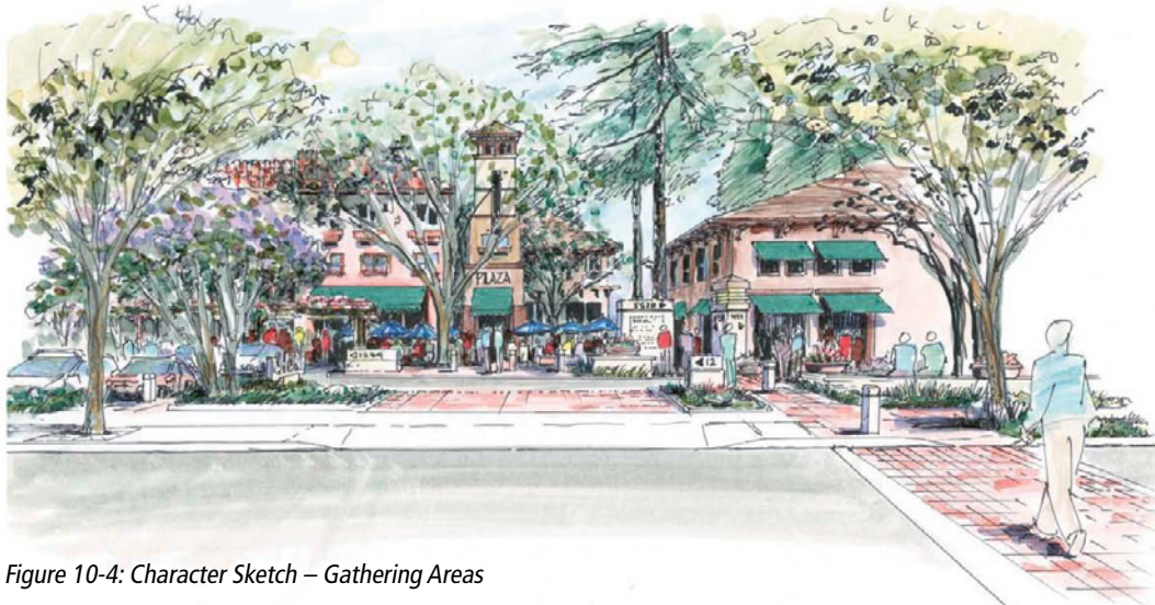
Figure 10-4: Character Sketch – Gathering Areas