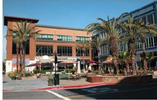
Attractive gathering/public spaces