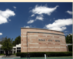
City Hall 100 Civic Plaza (925) 833-6650