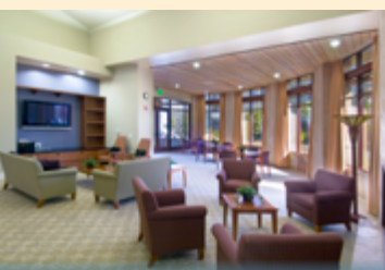
Dublin Senior Center 7600 Amador Valley Blvd. (925) 556-4511