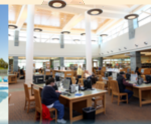
Dublin Library 200 Civic Plaza (925) 803-7252