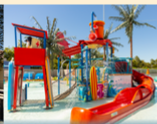
The Wave 4201 Central Pkwy. (925) 574-4800