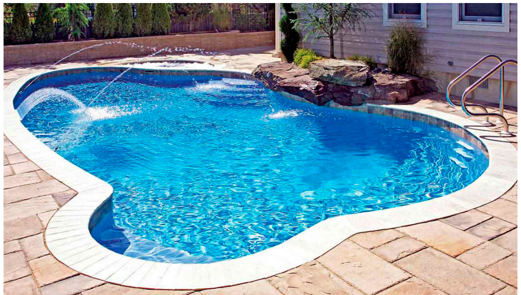
Sheds, spas, pools, and gazebos